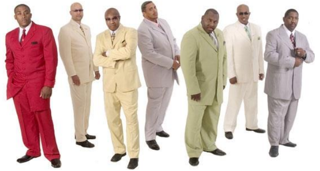
The Voltage Brothers

"Electric" is just one way of describing America's #1 show band: The Voltage Brothers. Performing top hits from every genre, The Voltage Brothers' repertoire consists of your favorite R&B, swing, Carolina beach music, disco, funk, hip hop, jazz, Motown, pop, and even classic rock hits. The Voltage Brothers have traveled the world with the Kool Jazz Festival and appeared with renowned artists including: Frank Sinatra, The Temptations, The Commodores, The O'Jays, Kool & The Gang, Gladys Knight and the Pips, and Earth, Wind, & Fire. They performed at nine straight Super Bowls from 1991 to 1999. Additionally, they were special guest artists at the 1993